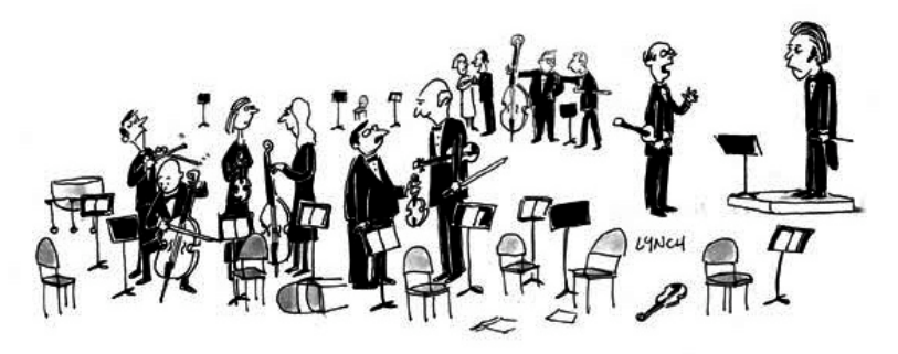
"Pardon me for saying this - but you need to be more of a control freak."

"This depends on the individual student's personal situation. For some students it is not an option to attend graduate school full time. However, if one can at all make it happen, going full time is the best way to go in order to maximize your learning and exposure to every aspect of the university where you attend." – B. Kent