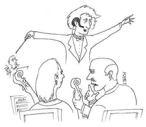
"The union says as long as it's 'hands-free,' it's allowed."